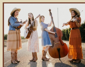
The GillyGirls Band

Valley View Retirement Village 15600 SW Rock of Ages Road McMinnville, OR 97128 503-472-6212