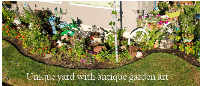
Unique yard with antique garden art

In the deer proof community garden, six gardeners are growing veggies this year. Each one has a raised bed to grow: garlic & onions, tomatoes, peppers, broccoli, beans, salad greens, beets, and assorted squash.