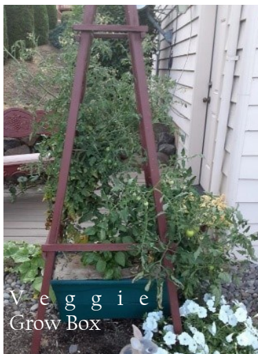
Vegetable Grow Box

In the deer proof community garden, six gardeners are growing veggies this year. Each one has a raised bed to grow: garlic & onions, tomatoes, peppers, broccoli, beans, salad greens, beets, and assorted squash.