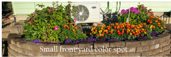
Small front yard color spot