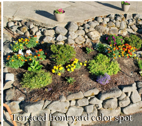
Terraced front yard color spot