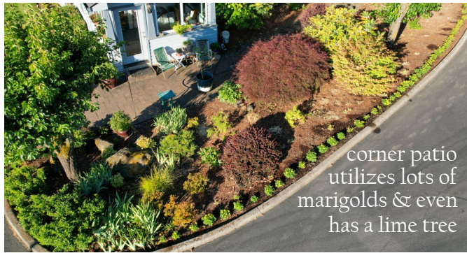
corner patio utilizes lots of marigolds & even has a lime tree